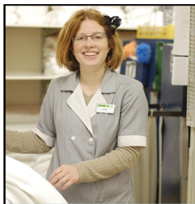
Holiday Inn & Suites, Eastgate