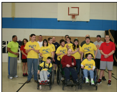
The Wildey Comets returned for one more game of March Madness against the Clermont DD Staff on March 26. It was a close game, but the Comets pulled out another victory.